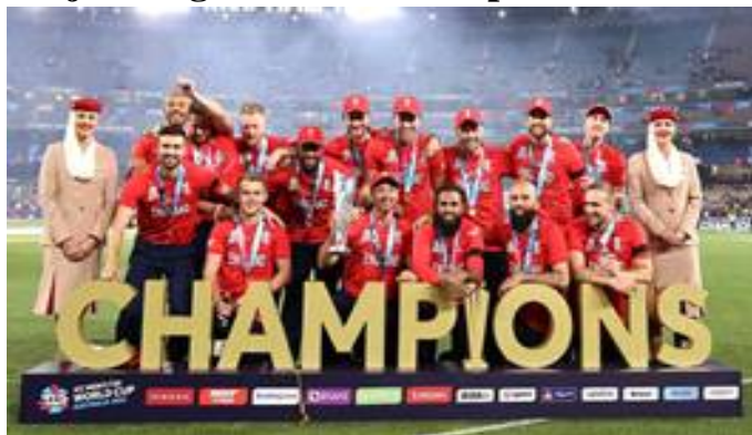
Melbourne 13 (IANS)

Mat. 13: Thaimien Australia kadihga T20 world Cup mathen bambo kaloibo mathen ga England nai Pakistan Melbourne Cricket Ground ga Nidnai mathen kiubo ga England niu Pakistan tu five-wicket gasu ngamkhai