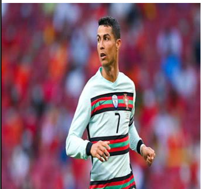
Barcelona, Spain 25 Sep.

Tadmibo nidkak Nidwannai UEFA Nations League football Sinobo stadium Prague namdih, Czech Republic ga Portugal nai Czech Republic mathen jiu Portugal niu goal 4 chankhai jiu ngamkhai mide. Chiudi kadhipiri ga football mathen ga palu jan tadbambo kadih, Spain maira Switzerland tu ngam lakjiu tamine.