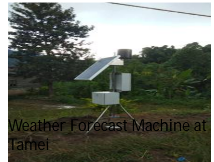
Weather Forecast Machine at Tamei

Uefa Nation League mathenjiu bambo hai n-danai Spain nai Portugal mathen jiu Spain Ivaro Morata niu goal chan khai jiu 1-0 gasu Portugal tu ngamjiu semifinal khang mide. Spain, Italy, Croacia khatdi Netherlands paliu hai mahkum Chageehiu 2023 ga semis mathen lan sune.