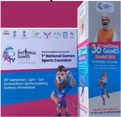
The Hindu. Ahmedabad

N-gen. 28: Luan 36th bo National Game 2022 hai Narendra Modi Stadium, Ahmedabad ga thainai Prime Minister Narendra Modi niu lepet khai sunechiujui tacham ga dinne. Siga Union Youth Affairs and Sports Minister Anurag Singh Thakur khatdi tam-tambo dignitaries di wang karen sune chiujiu dinne. Gujarat State ga national Game hai thaimien niu rai kachanbo thiujui khai bowe haisi Chagahiu zengtung 12th katang tadkiu sune. Chamai sang 15 san niu wangjiu tam-tambo mathen hai mathen kiu sune, khatdi thaikum gu National Game niu then majen suang di kachangbo khatdi chamai keng thubo mathen thiu sune chiujiu dinne. Mathen hai Ahmedabad, Gandhinagar, Surat, Vadodara, Rajkot khatdi Bhavnagar chiujiu cities 6 ga mathen hai tadkiu sune,