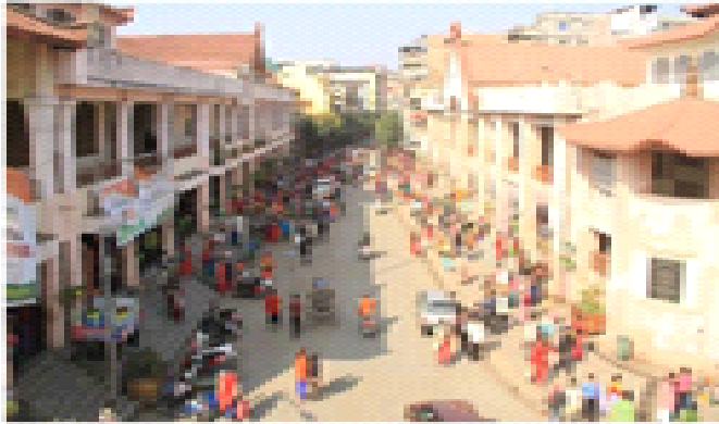
Khwairamband Ima Keithel

New Temporary Market, Imphal West district ga 144 CrPC zeng 7 leng khai mide.